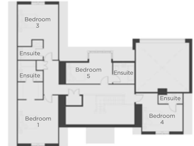
FIRST FLOOR DIMENSIONS